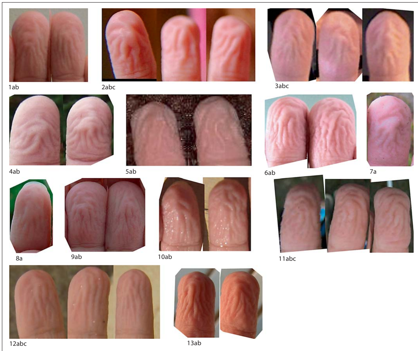
Fig. 4. Wet-wrinkle networks on 28 fingers from 13 hands. These were found in the public online domain and were kept so long as the image was sufficiently sharp to see the wrinkles.

response. Wilder-Smith [2004] provides evidence that the finger-wrinkling mechanism may be due to digit pulp vasoconstriction: wet-induced wrinkles are accompanied by vasoconstriction [Wilder-Smith and Chow, 2003a], and wrinkles are induced by vasoconstrictive agents [Wilder-Smith and Chow, 2003b; Wilder-Smith, 2004].