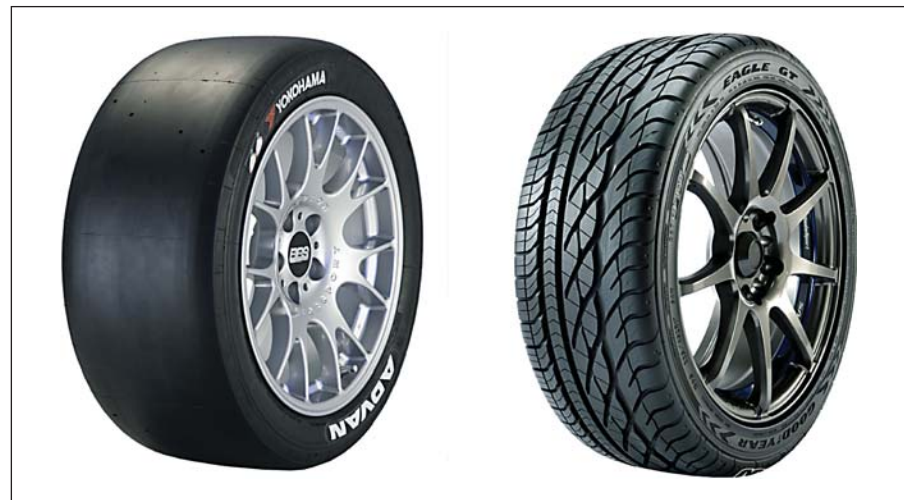
Fig. 2. Smooth tires such as the racing tire (left) provide the best grip in dry conditions. In wet conditions, however, rain treads (right) are better. Here, we explore the hypothesis that, although smooth fingertips provide the best grip in dry conditions, fingertips wrinkle in wet conditions for better grip, akin to rain treads.