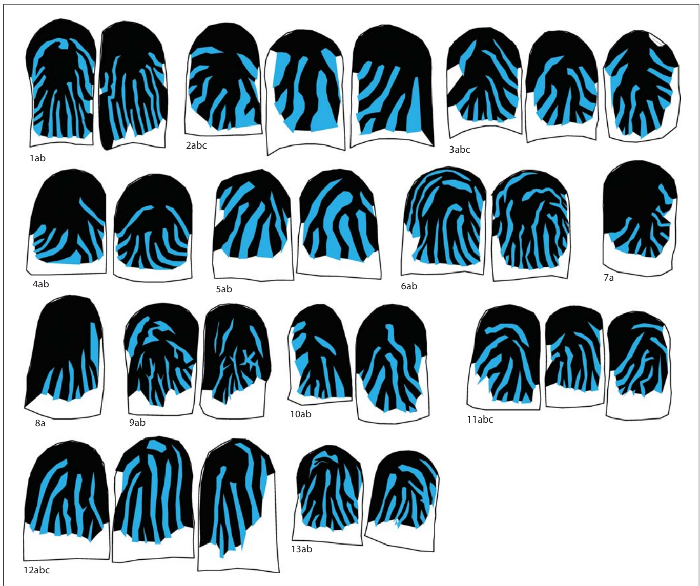
Fig. 5. Channel-like troughs in finger wrinkles (light blue; color refers to online version only), and the borders between them (black), for the fingers in figure 4. The signature of a drainage network on a convex promontory (see fig. 3b, d) is readily apparent; disconnected channels diverge from one another away from the peak, and divides form a connected tree with its root at the peak.

another uphill. However, drainage networks are dramatically different in topographies such as convex promontories, where roughly the ‘opposite’ is found: the channels are disconnected from one another and diverge away from one another downhill, and divides link together to form a tree with its trunk at the promontory’s peak (fig. 3b).