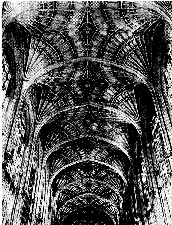
FIGURE 2. The ceiling of King's College Chapel.

the Tudor rose and portecullis. In a sense, this design represents an 'adaptation', but the architectural constraint is clearly primary. The spaces arise as a necessary by-product of fan vaulting; their appropriate use is a secondary effect. Anyone who tried to argue that the structure exists because the alternation of rose and portecullis makes so much sense in a Tudor chapel would be inviting the same ridicule that Voltaire heaped on Dr Pangloss: 'Things cannot be other than they