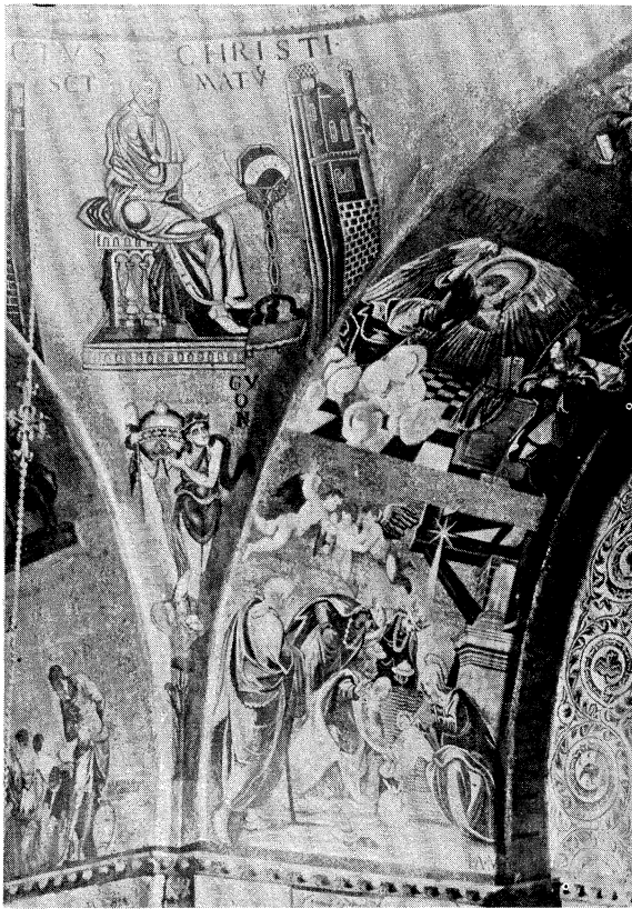
FIGURE 1. One of the four spandrels of St Mark's; seated evangelist above, personification of river below.

The design is so elaborate, harmonious and purposeful that we are tempted to view it as the starting point of any analysis, as the cause in some sense of the surrounding architecture. But this would invert the proper path of analysis. The